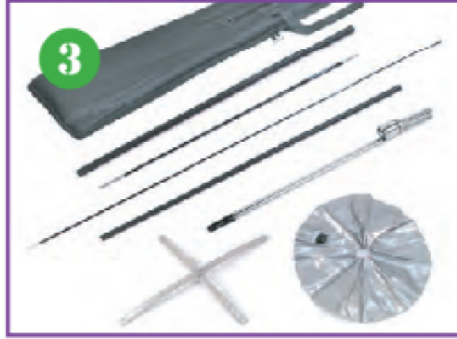
3. Take out the poles and Spike (Outdoor set) or Cross base & Water Bag (Indoor set).