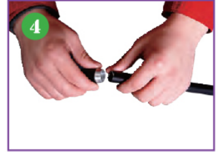
4. Connect the poles one by one.