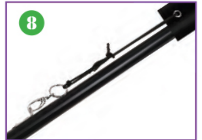
8. Secure the Bungee with the Carabiner Clip (as shown) and connect it to the loop on base pole.