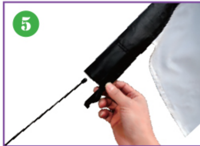
5. Insert the pole into the graphic sleeve.