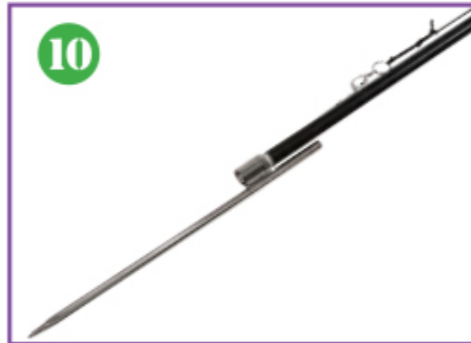
10. Completed flag ready for display on soft ground surface.