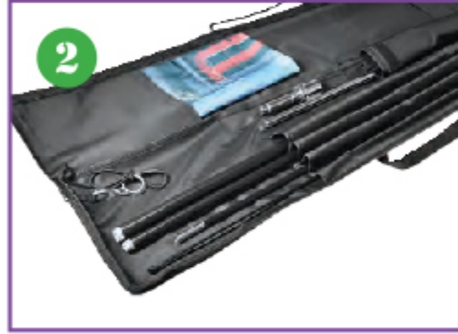
2. Open the bag.