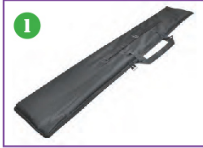
1. Bag with stand.