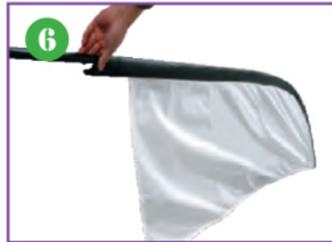
6. Gently pushing the pole all the way to the end.