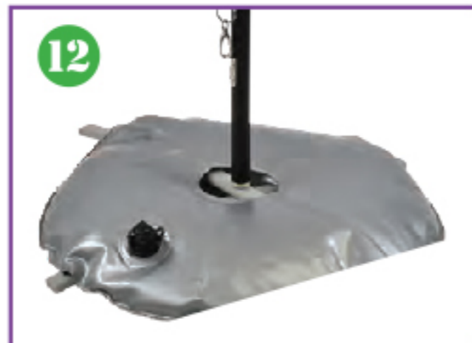
12. Fill waterbag and position in place, over X Base.