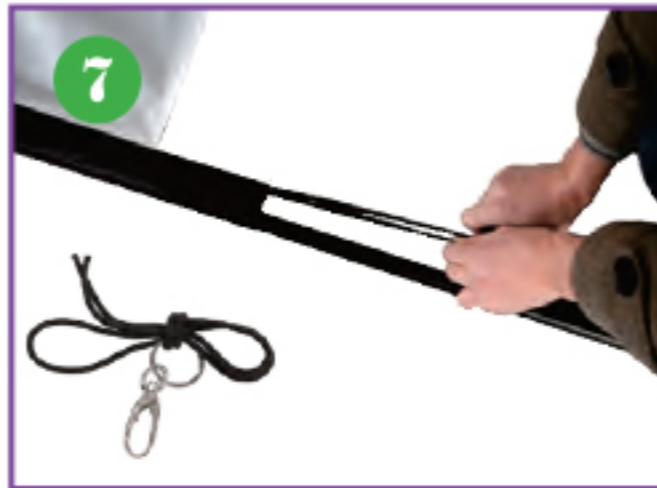
7. Thread the Bungee Cord through the grommet at the bottom of sleeve.